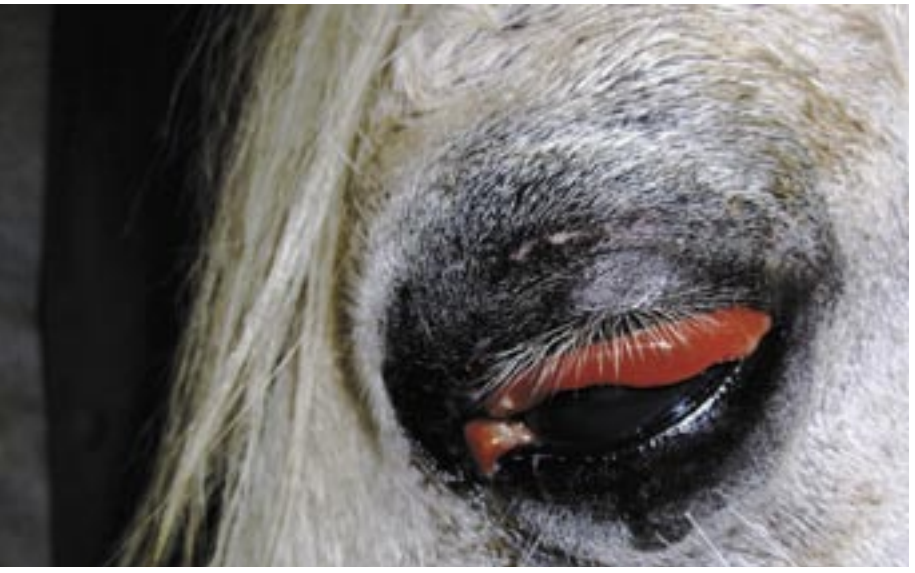
Inflammation is one of the symptoms of uveitis.

Treatment of an SCC involves removal of the entire third eyelid. The earlier this condition is diagnosed, the more successful this is likely to be, but this is a tumour that does have a tendency to local recurrence.