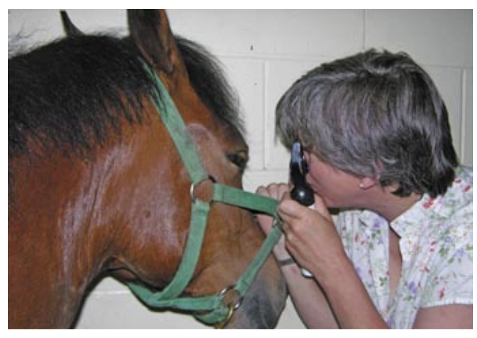
Examining the eye with an ophthalmoscope can help reveal any abnormalities.

Vision tests must always be performed without contact with a handler or another horse, and in unfamiliar surroundings. Horses on a short lead in a familiar environment, or foals in contact with their dam, may not reveal any visual difficulty that is present.